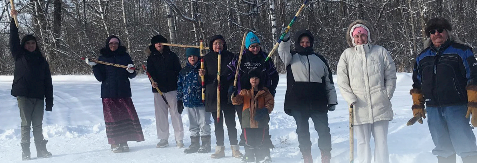
Kids and parents at a Return of the Buffalo retreat show off their snow snakes. Your gifts bring families together on the land in all seasons.